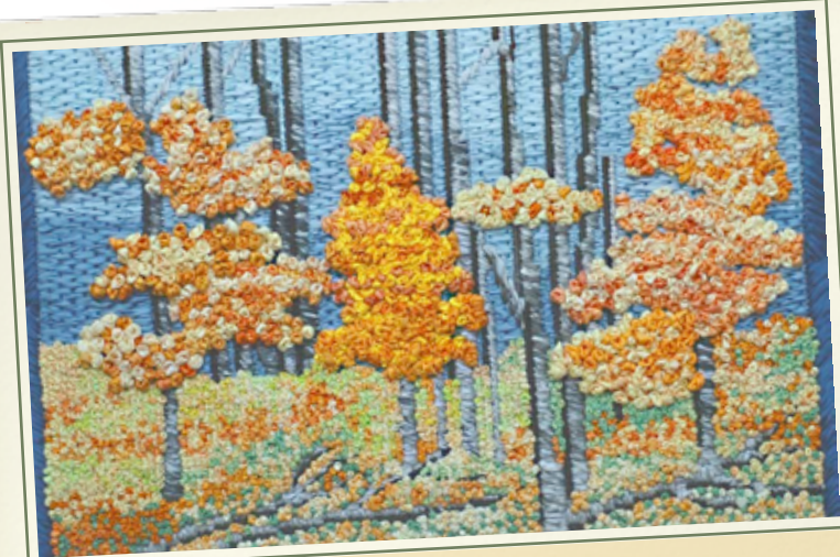
ANN CRAM "ROADSIDE"